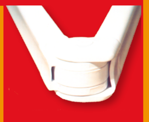
The tecno arm assures the tenseness of the canvas in each position of the awning, offering in addition an elegant and new aesthetic outlook

Soltex only uses guarenteed and accredited materials of premium quality in the EU, stainless stell screwing and aluminium profiles laquered under the Qualicoat standard