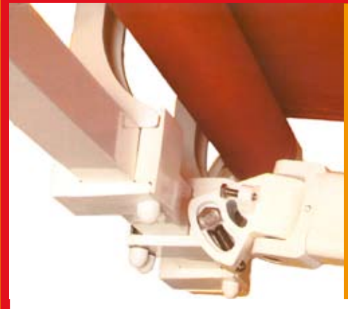
The new regulation system is simpler and simulaneously much stronger, perfect for Lanzarote's climate...